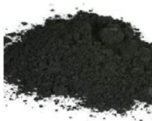
FIG.1 ACTIVATED CARBON POWDER (GROUNDNUT SHELL)